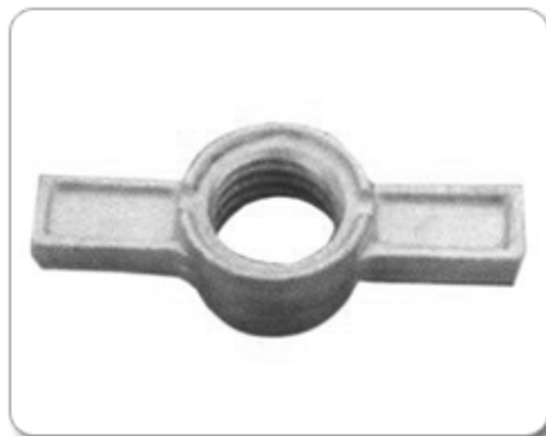
Threaded JACK NUTS

Sizes: 32 mm, 36 mm & 40 mm. Thread Size: ACME Thread